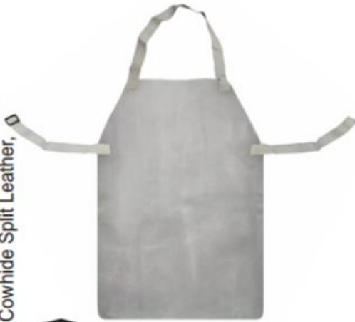
Art No: 110