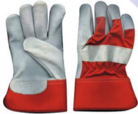
Art No: 111