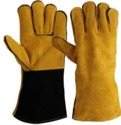
Art No: 213