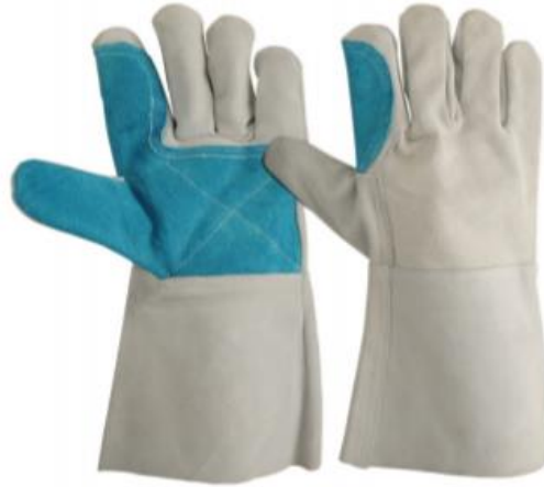
Art No: 219

ArtNo. LPI-G- 218 Cowhide split Leather, Fleece and Denim jeans cuff Lining