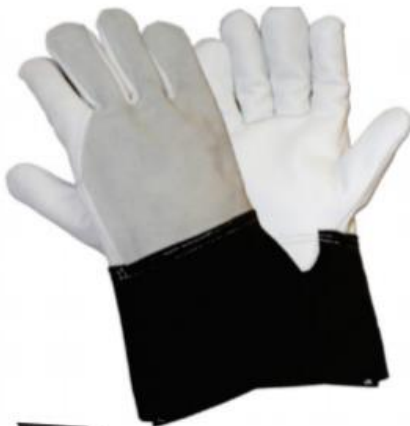
Art No: 214