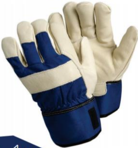
Art No: 114