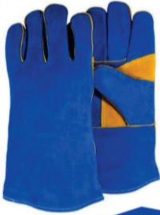
Art No: 216

ArtNo. LPI-G- 216 Hockey Palm, Cowhide split Leather, Fleece and Denim jeans cuff Lining