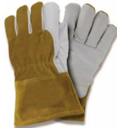
Art No: 215