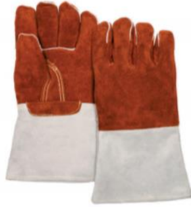
Art No: 217

ArtNo. LPI-G- 216 Hockey Palm, Cowhide split Leather, Fleece and Denim jeans cuff Lining