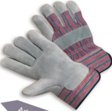
Art No: 110