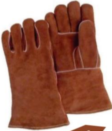
Art No: 218

ArtNo. LPI-G- 217 Cowhide split Leather, Fleece and Denim jeans cuff Lining