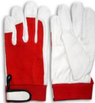
Art No: 314