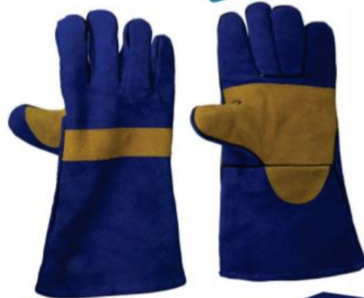
Art No: 221

ArtNo. LPI-G- 220 Oven Glove Cowhide split Leather, Double Fleece and denim jeans cuff Lining