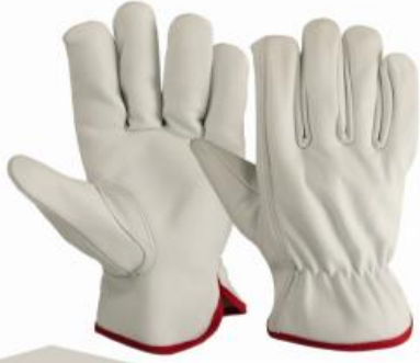
Art No: 310