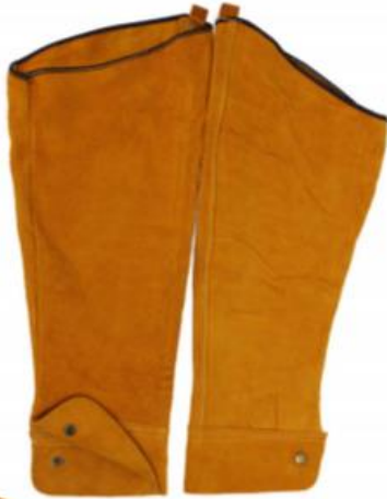
Art No: 210