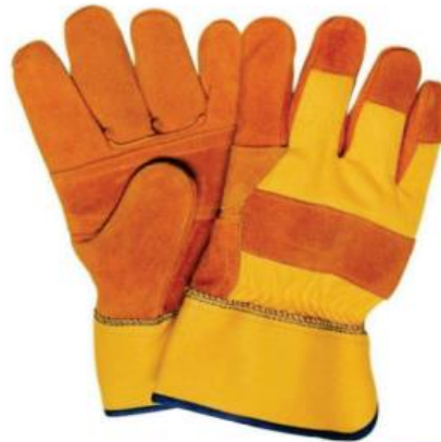
Art No: 121

ArtNo. LPI-G- 120 Double palm, cowhide split Leather, PC cotton back cloth and Rubberized cuff