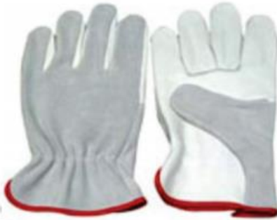
Art No: 312