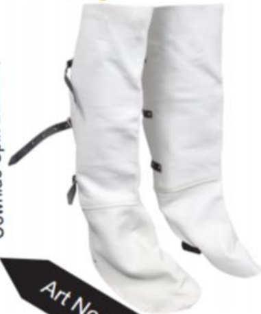
Art No: 310