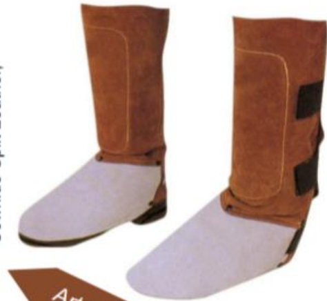
Art No: 311