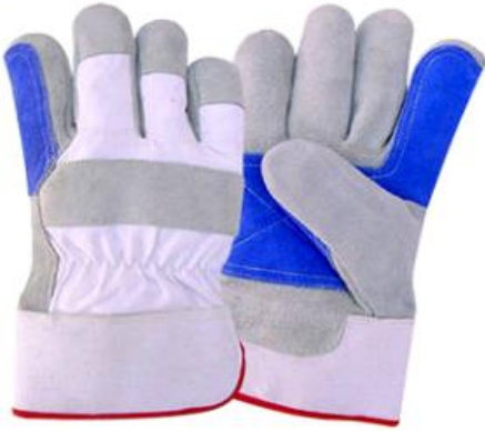
Art No: 116

ArtNo. LPI-G- 116 Double palm, cowhide split Leather, 100% cotton back cloth and Canvass cuff