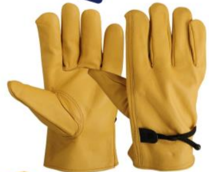
Art No: 317