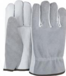
Art No: 313