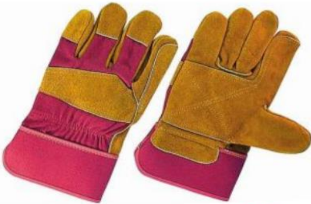
Art No: 120

ArtNo. LPI-G- 119 Double palm, cowhide split Leather, 100% cotton back cloth and Rubberized cuff