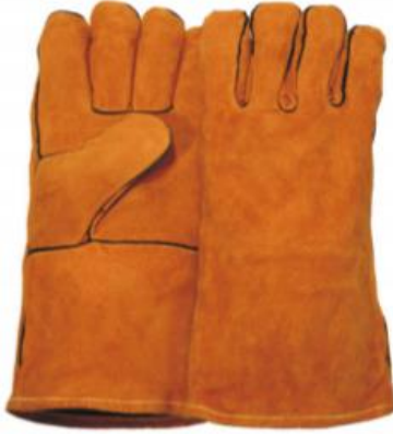
Art No: 210