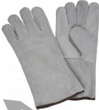
Art No: 212