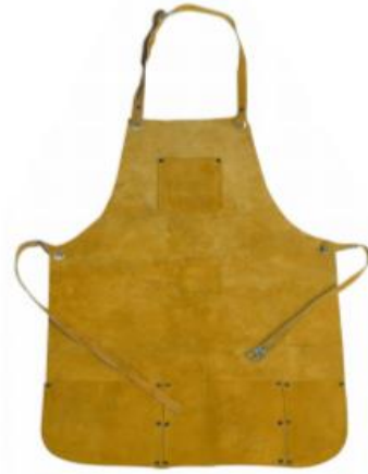
Art No: 111