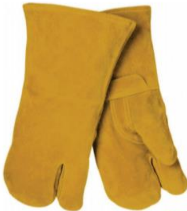
Art No: 220

ArtNo. LPI-G- 219 Double Palm, Cowhide split Leather, Without Lining