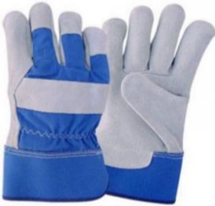
Art No: 112