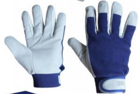
Art No: 315