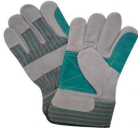
Art No: 119

ArtNo. LPI-G- 118 Double palm, cowhide split Leather, PC cotton back cloth and Rubberized cuff