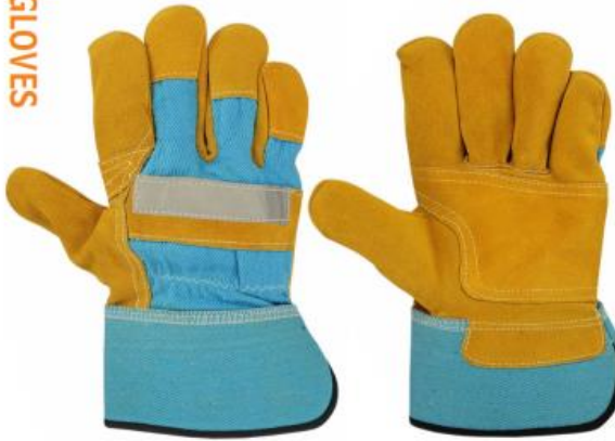
Art No: 118

ArtNo. LPI-G- 117 Double palm, cowhide split Leather, PC 100% cotton back cloth and Rubberized cuff