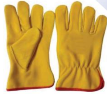
Art No: 311