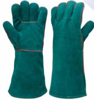
Art No: 211