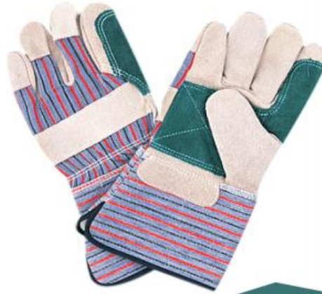
Art No: 117

ArtNo. LPI-G- 116 Double palm, cowhide split Leather, 100% cotton back cloth and Canvass cuff