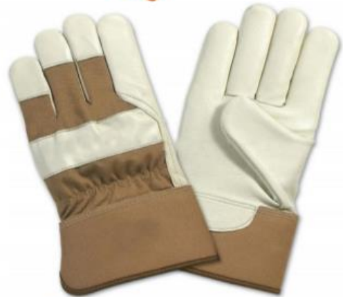
Art No: 115